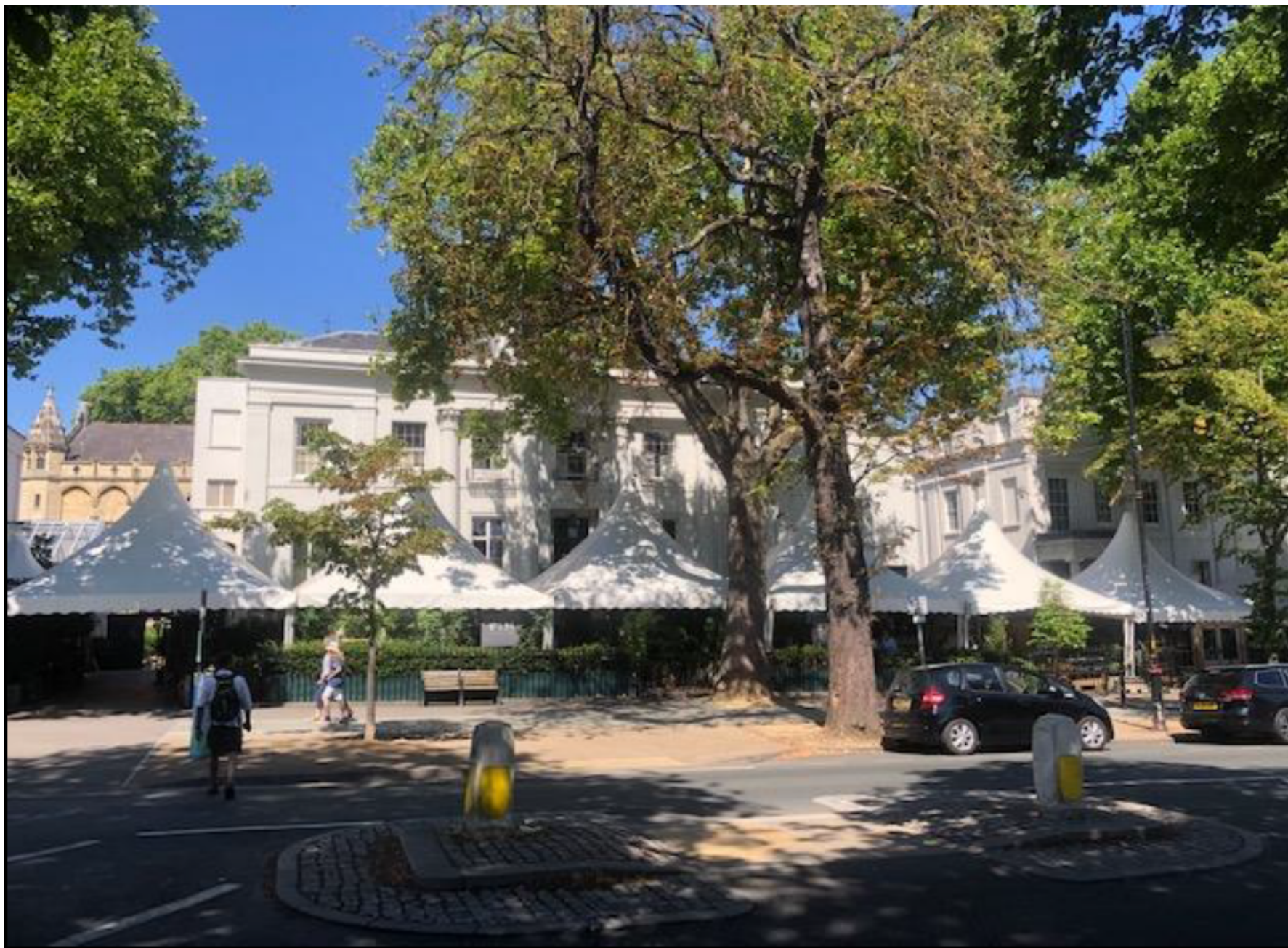
Photograph of the marquees in front of 129 - 131 The Promenade