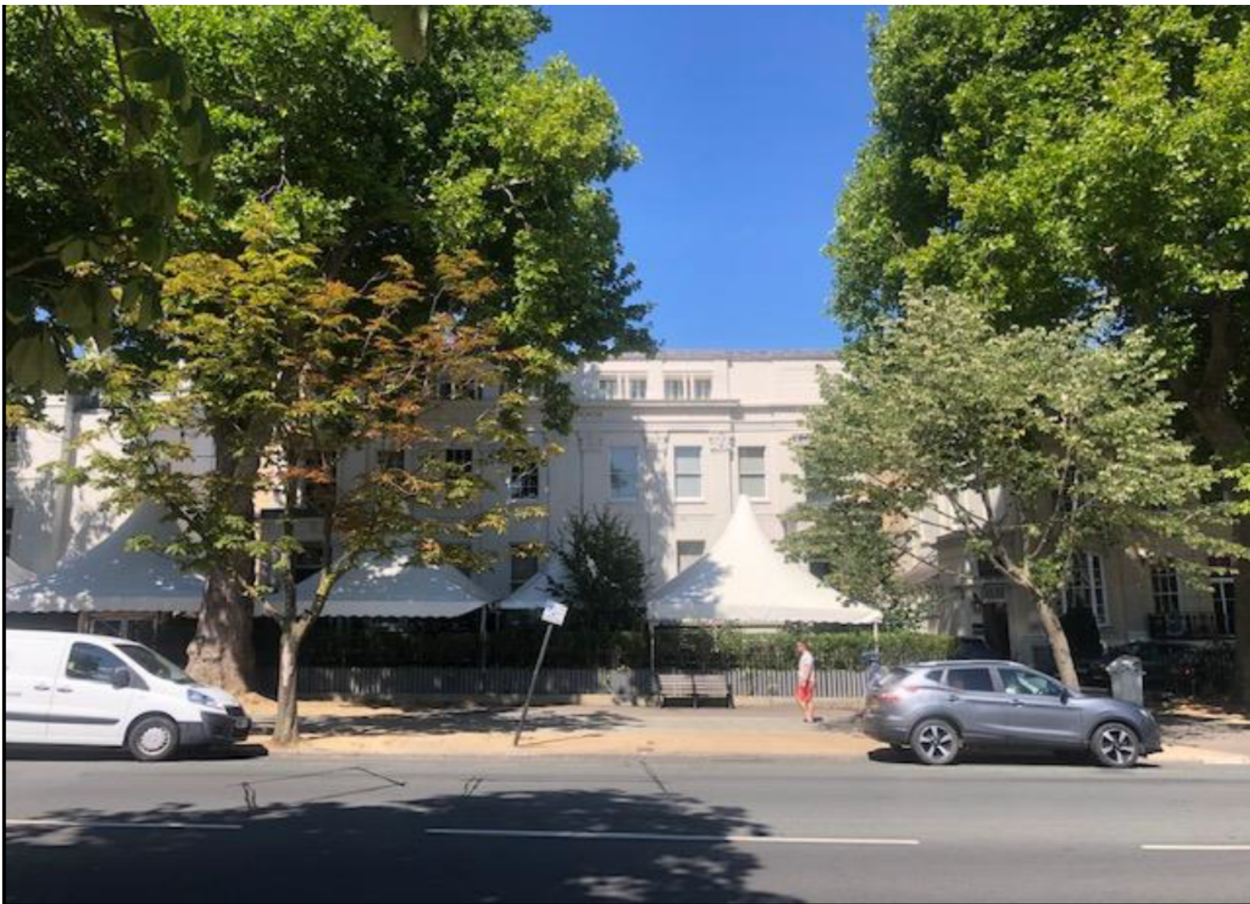
Photograph of the marquees in front of 125 - 127 The Promenade